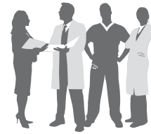
dental access points 1